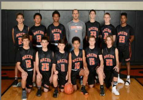
8th gr. Monroe City Bracket Boys Girls

MAP (Grade-Level) Scores are in. If you would like a copy of your students assessment, please let the me know. Updated assessment data for your student can also be found on your parent portal under the assessment tile. Please let me know if you have any questions. Mrs. Toll